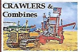
CRAWLERS & Combines