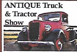
ANTIQUE Truck & Tractor Show