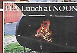
FEA Lunch at NOON